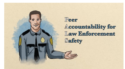
PALS OVERVIEW VIDEO