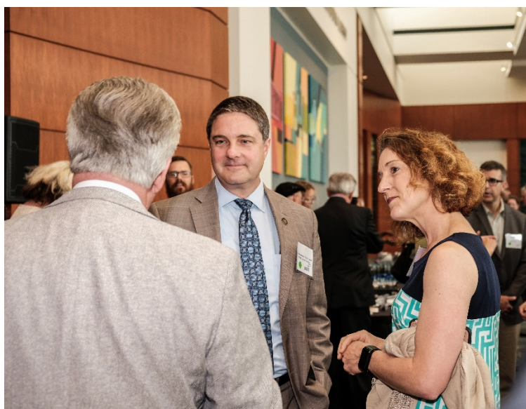
Sen. Warren Daniel (center) meets with colleagues at League event.

SB 220 originally passed the Senate in 2017 but did not make it through the House prior to that year's adjournment. Currently municipalities and counties are exempt from paying motor fuel taxes; this law expands that exemption to any agency created by an interlocal agreement between two or more governmental units for the purpose of providing police, fire, or emergency services. SL 2018-39 applies to any such joint agency, but there is only one agency in the state that is currently known to meet the law's criteria.