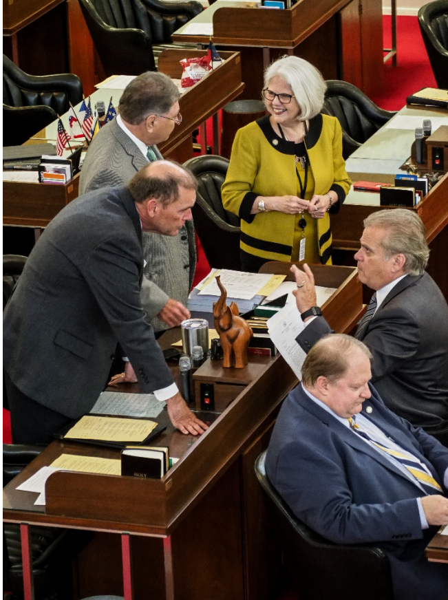
House colleagues deliberate before an afternoon of voting.

In a follow-up to last year's comprehensive system development fee law , this consensus