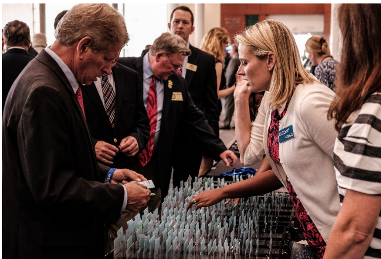
Hundreds of public servants attended the League's first-ever Town & State Dinner.

HB 1056 is the Treasurer's Office's suggested statutory changes to promote financial accountability, integrity, and recovery of assets of the state-administered pension systems, the disability income plan, and the state health plan. This law includes a provision to allow the retirement system to attach or garnish the employer's credit card receipts or other third-party payments in payment of the amount owed to the state. HB 1055 included provisions proposed by the Treasurer's Office to reduce the complexity of the state-administered pension systems and add value to the retirement benefits of public