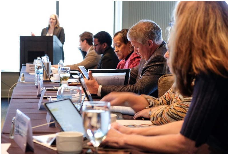
The League Board of Directors in session this year in Raleigh.

In an update to laws governing local alcohol and beverage control elections, this measure made it easier for certain small towns to hold a malt beverage or unfortified wine election. Specifically, the law loosened threshold requirements a town must meet to be eligible to hold such a referendum.