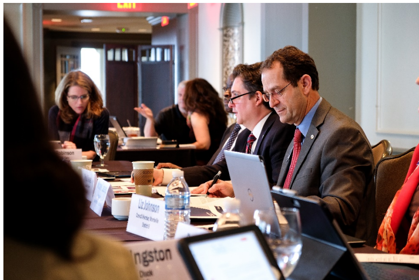
League leadership plotting the course at a Board of Directors meeting.

Unrelated to the environment, the law included a provision to repeal a restriction of authority in the 2018 budget that prevented cities from requiring schools to pay for transportation improvements as part of the land use approval process for those developments. However, SB 335 Budget Technical Corrections & Study reverted the law back to the restriction that was found in the budget.